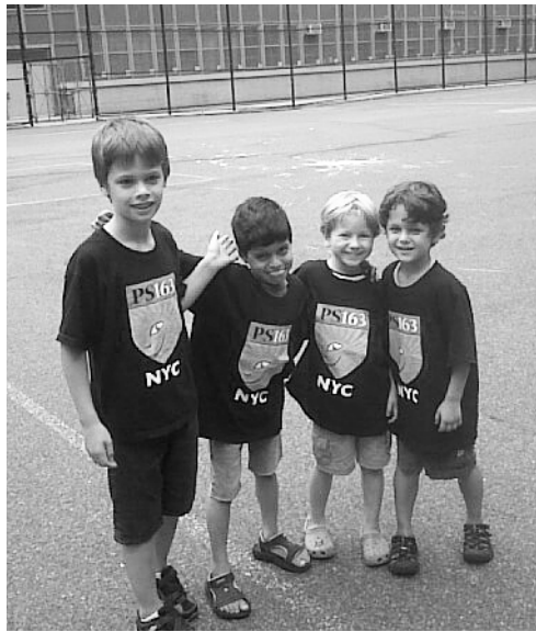
These guys had lots of fun at the Back-to-School Playdates. Did you miss it? See you next time!